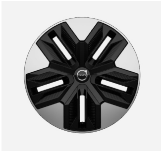
18" 5 Spoke